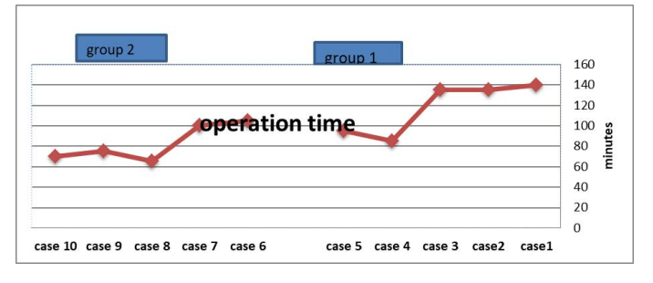
Figure. 6. Operation time differences between group 1 and 2.

There is a statistically significant reduction in the operation time (both AOT and SOT) in group (2) when compared with group (1) ( p \ge 0.05 ) as shown in (Figure 6).