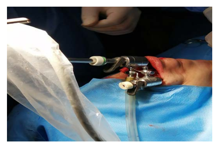
Figure. 4. Positions of the ports.