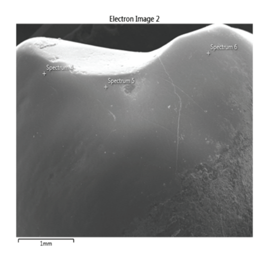
Fig. 2. Target study sites/locations marked in enamel surface layer